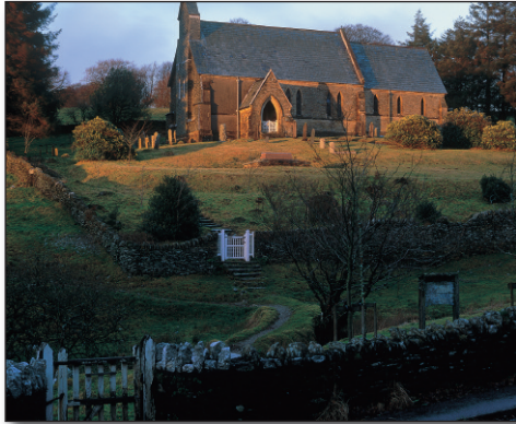
Late-afternoon light bathes the church at Simonsbath in a warm welcoming glow.