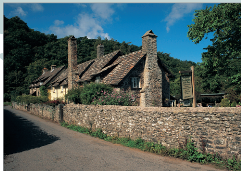
Example of a double-page spread.