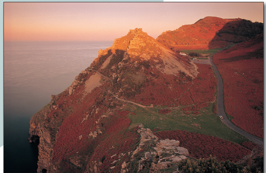
The Valley of Rocks.