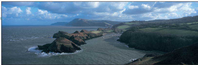
Watermouth, Hangman and Beyond.