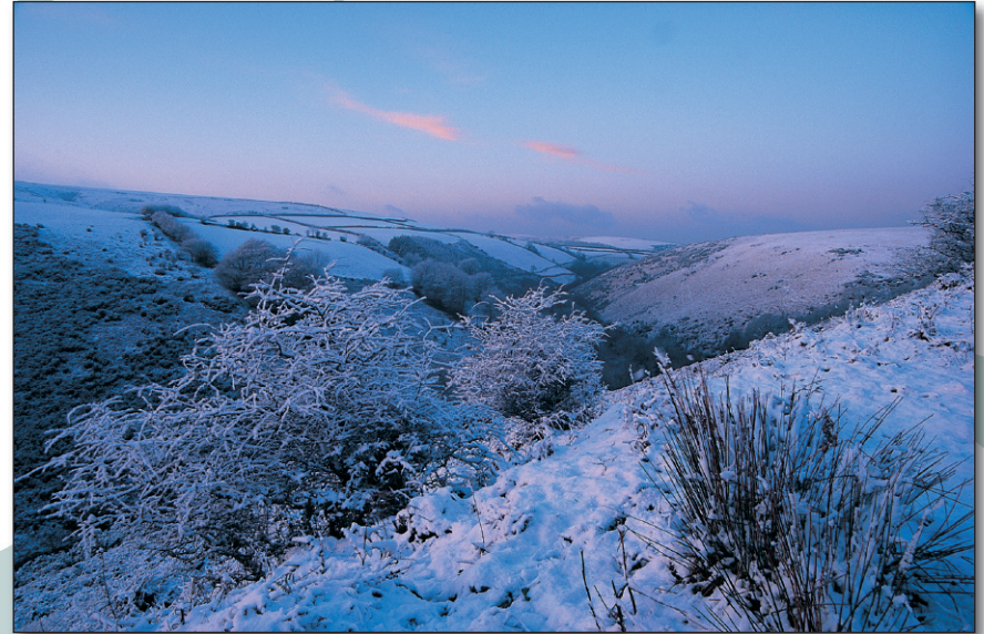
Blackford Combe near Nutscale, on a chilly winter's eve.